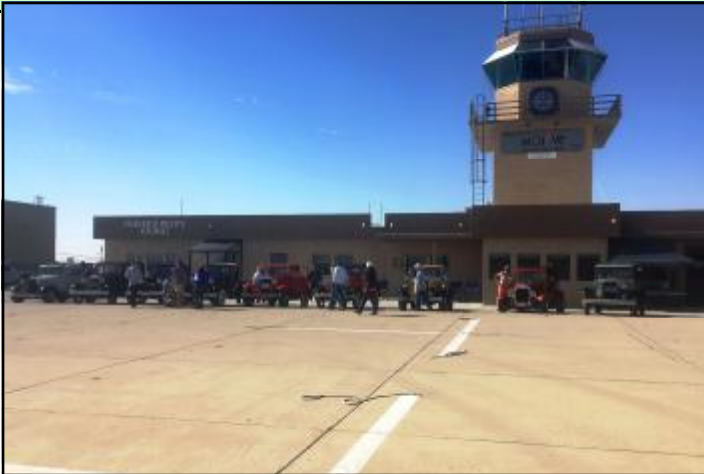
The Tower at Mohave Airport