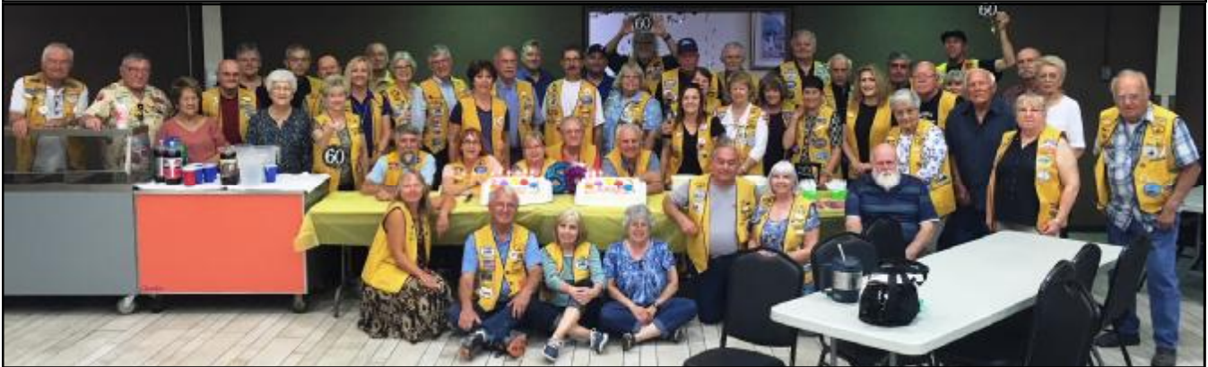
The Bakersfield Chapter of MAFCA on the advent of their 60th Anniversary Birthday Party

The Model A Ford Club of America - Bakersfield Chapter