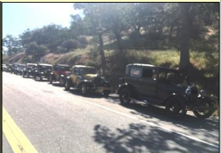
We stopped at the Tehachapi Loop coming home.